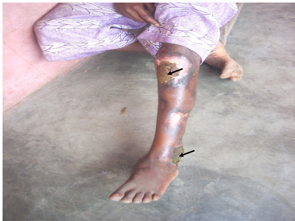
Figure 2 Herbal treatment for ulcers*.

*Respondent has had BU for more than 3 years and is being treated at home by his grandfather, a herbalist. Respondent's current condition is from recurring BU infections. The green patches (arrowed) are herbal dressings. Note the multiple scarring. Picture taken by Mercy Ackumey in the Otupaleam community, 2008.