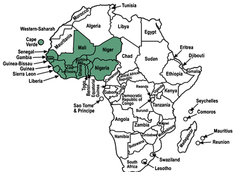
Figure 1 Western Africa: Economic Community of Western African States (ECOWAS) Countries: Benin, Burkina Faso, Cape Verde, Cote d'Ivoire, Gambia, Ghana, Guinea, Guinea-Bissau, Liberia, Mali, Niger, Nigeria, Senegal, Sierra Leone and Togo.

First, the need to urgently recognise and coordinate outbreak action-responses in affected African countries and in cross-border neighbours, as well as collaboration with those that experienced outbreaks in the past, is vital.