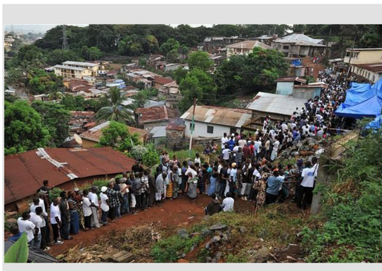
Figure 2 Ebola virus blood testing by government health workers in the Kenema district, Sierra Leone, June 25, 2014.

Unfortunately, several countries in Africa, as well as governmental and research institutions, are inadequately equipped in diagnostics, tracking, active reporting, prompt healthcare delivery, and accessible and affordable treatment to combat the Ebola infection and other emerging infectious diseases. The development of new tools, strategies and approaches, such as improved diagnostics and novel therapies including vaccines, is needed to prevent, control and contain Ebola as well as SARS, bird flu, Lassa fever, dengue and MERS outbreaks. Hence, the urgent need to develop and implement early warning alert and active surveillance response systems for emerging infectious diseases and the control and elimination of NTDs, as well as early warning and emergency systems, cannot be overemphasised. The prerequisites for fighting and