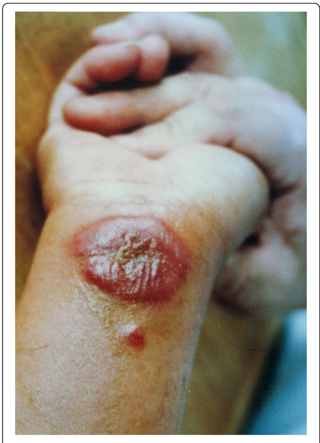
Figure 1 A large ulcer on the forearm with a small nodule both containing Leishmania amastigotes.

Ten cases (two with papule, seven with ulcer and one with nodular prurigo) with 67 skin lesions were selected for liquid nitrogen cryotherapy. After two to three days, crust was formed. Two months later, decrustation occurred and the lesion was healed. Follow-up examinations of five cases one to two years after treatment