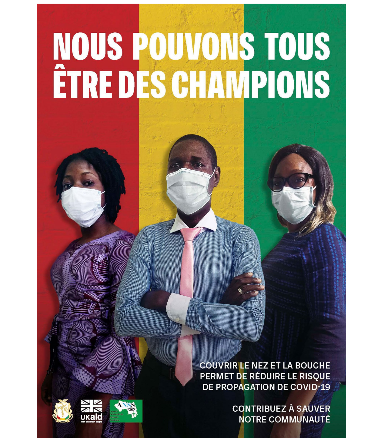
Fig. 3 Guinea poster. Poster created for ANSS and Health Service in Guinea, headline reads 'We can all be champions' by covering your mouth and nose you can stop the spread of COVID-19