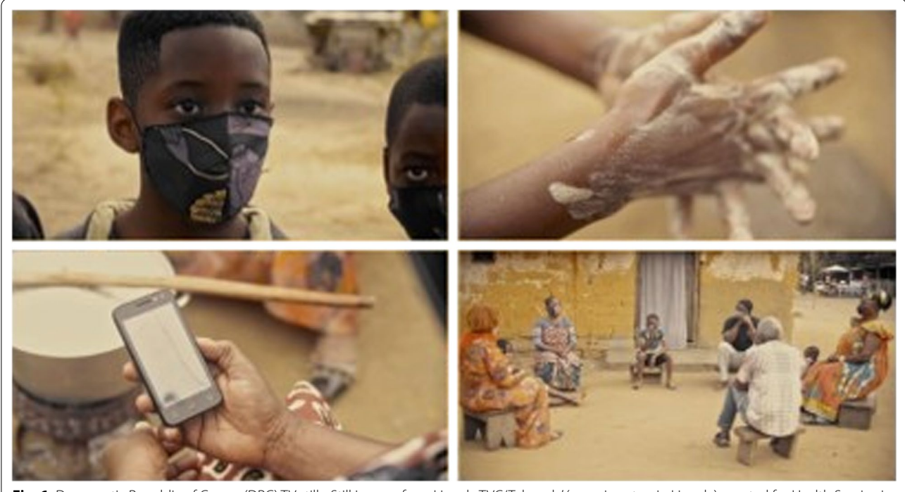
Fig. 6 Democratic Republic of Congo (DRC) TV stills. Still images from Lingala TVC 'Telemela' (meaning stop in Lingala), created for Health Service in DRC. Using popular actress and comedian Mere Bipendu to teach young children and the wider community, in the rural provinces, how to protect themselves from COVID-19

particularly on children. Implementation of NTD and other programmes with their extensive community reach and engagement with vulnerable populations is compatible with COVID-19 control as articulated in previous Sightsavers documents [24] https://www.sightsavers.org/ news/2020/06/water-sanitation-hygiene-strategies-takli ng-covid-19/ and https://www.sightsavers.org/progr ammes/ascend/.