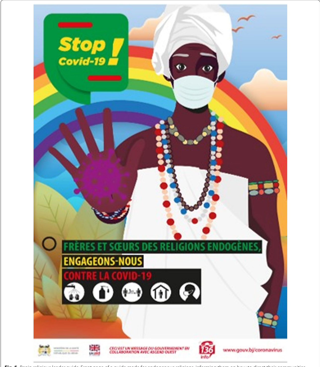
Fig. 5 Benin religious leader guide. Front page of a guide made for endogenous religions, informing them on how to direct their communities and themselves to stop the spread of COVID-19. Two additional guides were made for Christians and Muslims and distributed through community volunteers